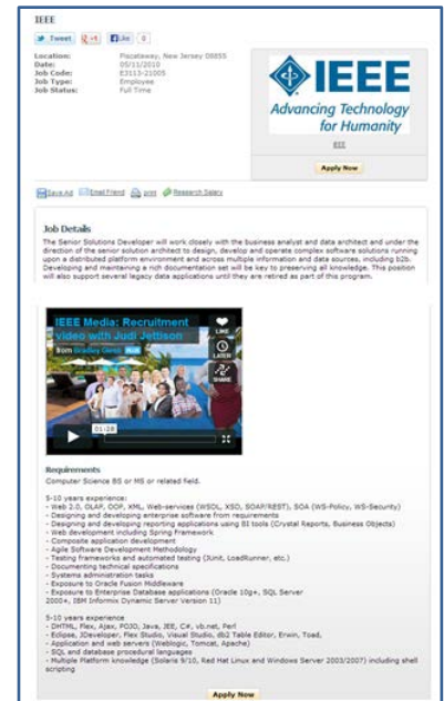
Company Logo & Video on Job Detail